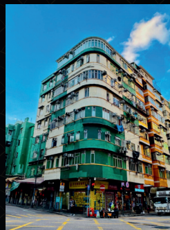
Capture your stylish photos here!

EXPERIENCE DAY TOUR (DAILY AVAILABLE UNTIL 31 DEC 2024)