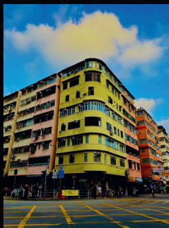
The iconic tenement buildings

However, with the rise of chain stores and modern hair salons, Shanghai barber shops are also facing talent loss and succession issues. It is rare to find Shanghai barber shops still operating in Hong Kong. In light of this, we will lead you to delve into the experience of this endangered craft, allowing you to create a brand new look in Hong Kong and capture stylish photos in the iconic tenement buildings that exude Hong Kong's unique charm!