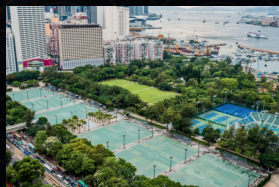
Hong Kong Victoria Park Football Pitches