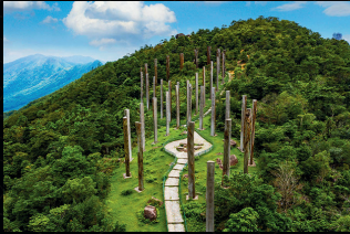
The Wisdom Path

The Wisdom Path, a large-scale outdoor installation featuring calligraphy carved into 38 wooden columns, which stands at the foot of Lantau Peak. Wisdom Path were erected in 2005 to resemble the bamboo tiles used for writing in ancient China. They are inscribed with simple, but profound calligraphy of the 'Heart Sutra' by the late Jao Tsung-I, an internationally renowned Hong Kong calligrapher and artist, and arranged in a figure-8 configuration to symbolise infinity. The installation's eye-catching location, dynamic design and enlightening message of 'non-attachment and unhinderedness of the mind' ensures it remains a hugely popular Ngong Ping destination among visitors — and regularly features in Instagram posts.