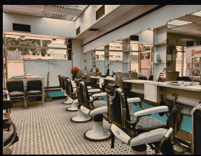
Traditional barber shop in hong kong