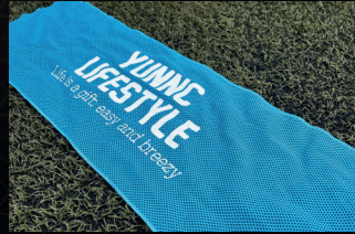
Life is a gift, easy and breezy!

EXPERIENCE 2 DAYS 1 NIGHT TOUR (EXCLUSIVE FOR 4 PAX OR ABOVE PRIVATE GROUP BOOKINGS ONLY)